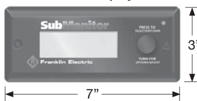
Detachable Display Unit